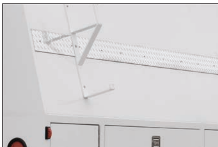
Ladder racks & customized options available to maximize interior and exterior storage