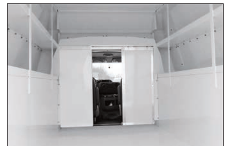
Customizable interior compartment layouts available for any industry

* Specifications, features and equipment shown for these models are based upon the latest information available. Warner Bodies, Inc reserves the right to make changes at any time, without notice, to features, equipment, options, price, colors, specifications, accessories and materials. For additional information, please contact your authorized Warner dealer. Some vehicle images may show optional equipment and vehicle colors not available.