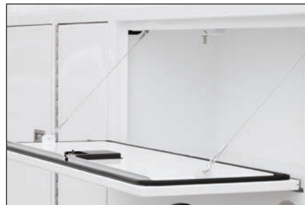
Flush mounted doors keeps contents secure, safe and dry