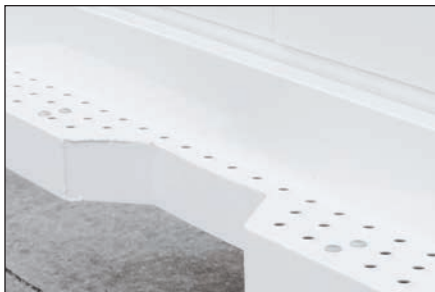
Heavy duty punched utility bumper allows user to step up safely