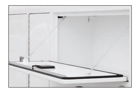
Flush mounted doors keeps contents secure, safe and dry