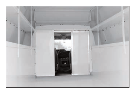
Customizable interior compartment layouts available for any industry