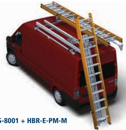
DPS-8001 + HBR-E-PM-M

Notes: Contact Prime Design customer service for application specific questions. Check the vehicle manufacturer's recommendation for roof capacity weight limits. A wide range of accessories are available including conduit carriers, light holders, and more.