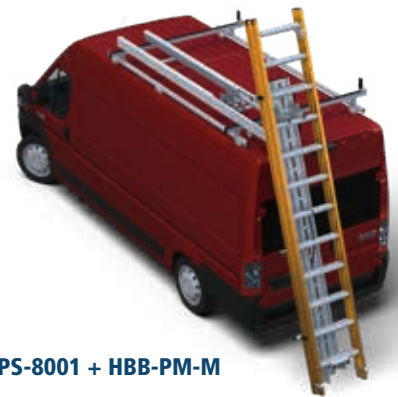
DPS-8001 + HBB-PM-M

DeployPro mounts to ErgoRack crossbars on the Base feature side