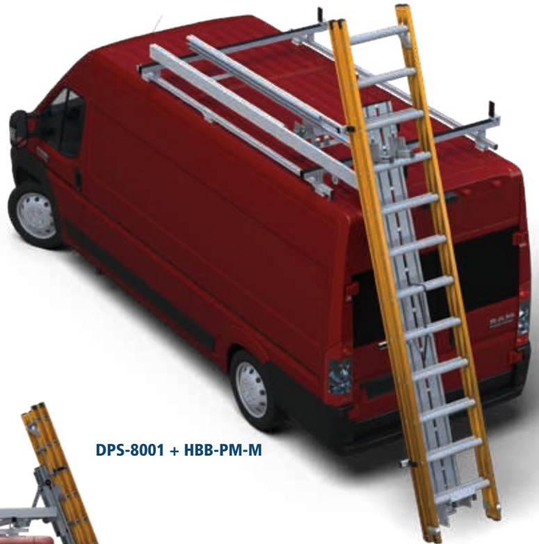
DPS-8001 + HBB-PM-M

The system's deploying and stowing features are ergonomic and help to protect operators from muscle stress, strain and fatigue. Get your fleet or business started today on the road to safety and productivity.